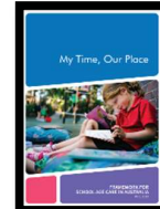
My Time, Our Place; Framework for School Age Care in Australia 2022 V2

Critical reflection: is a meaning-making process that assists informing future practice in ways that demonstrate an understanding of each child’s learning, development and wellbeing and implications for equity and social justice. It involves examining and analysing events, experiences and practices from a range of perspectives to inform future planning and decision-making ( Early Years Learning Framework 2022 V2 – refer to Sources ).